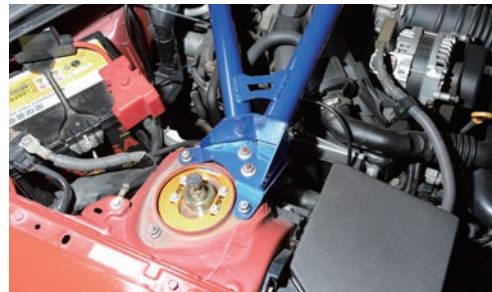
Illustration of installed state 完成示意圖