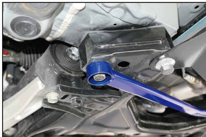
See figure 1 (參考圖表一)