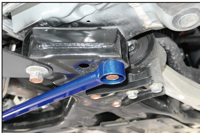
See figure 2 (參考圖表二)