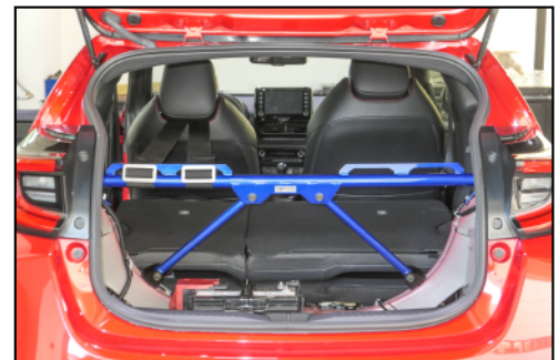
Illustration of installed state 安裝完成示意圖 ▼