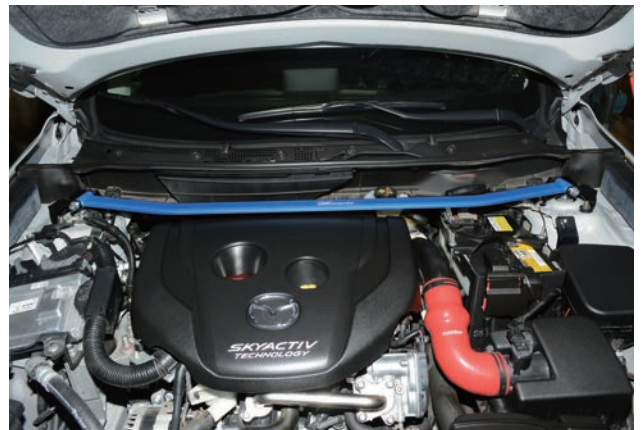
Illustration of installed state 完成示意圖