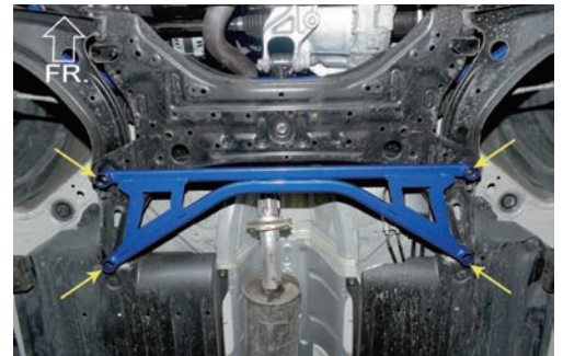
Illustration of installed state 完成示意圖