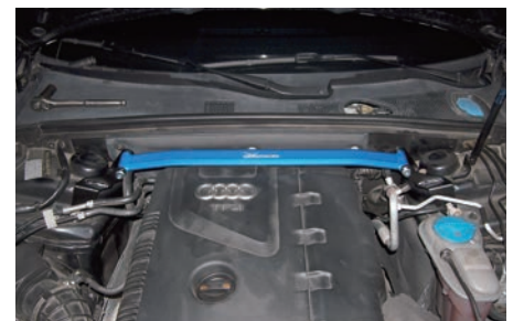
Illustration of installed state 完成示意圖