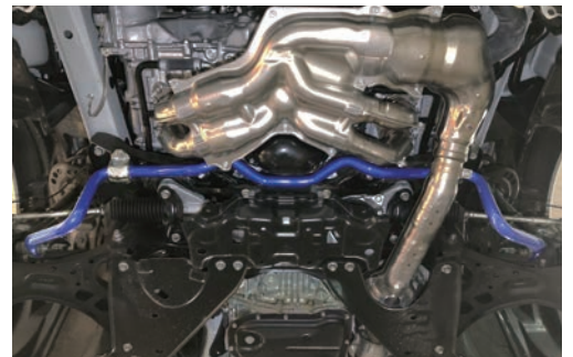
Illustration of installed state 完成示意圖