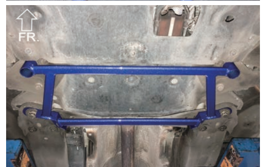
Illustration of installed state 完成示意圖