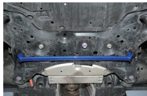
Illustration of installed state 安裝完成示意圖