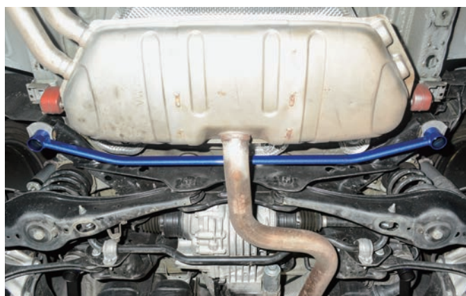
Illustration of installed state 安裝完成示意圖