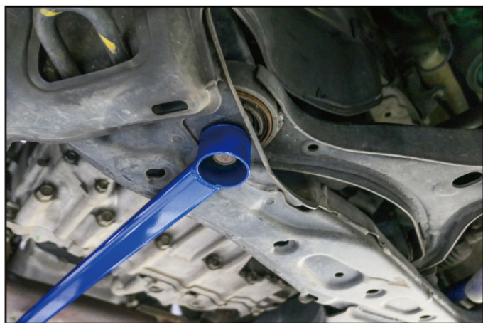
See figure 2 (參考圖表二)