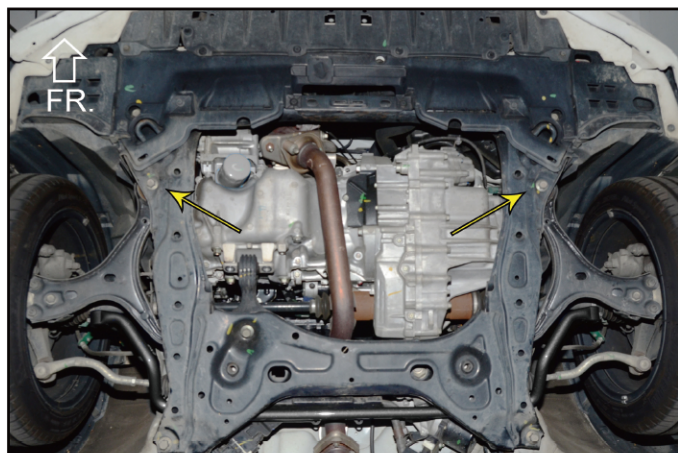
See figure 1 (參考圖表一)