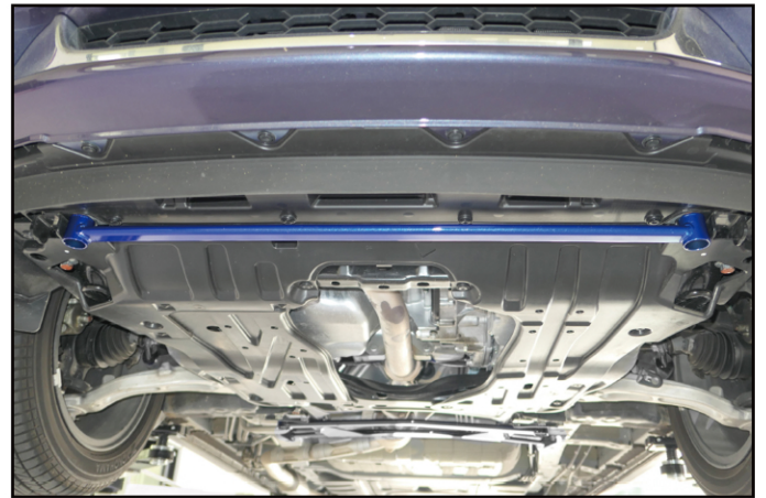
See figure 1 (參考圖表一)