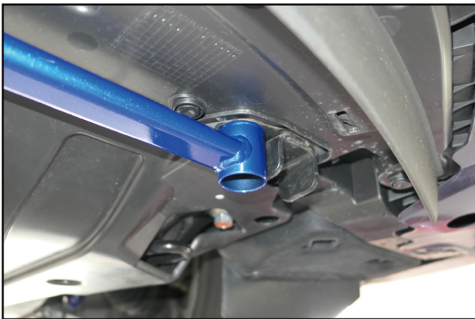
See figure 2 (參考圖表二)