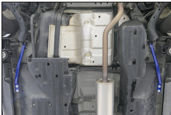
▼ Illustration of installed state 安裝完成示意圖