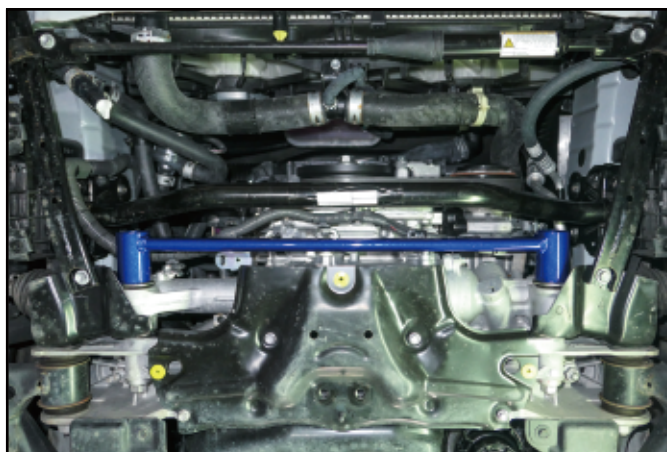
See figure 1 (參考圖表一)