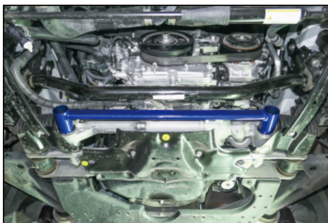
▼ Illustration of installed state 安裝完成示意圖