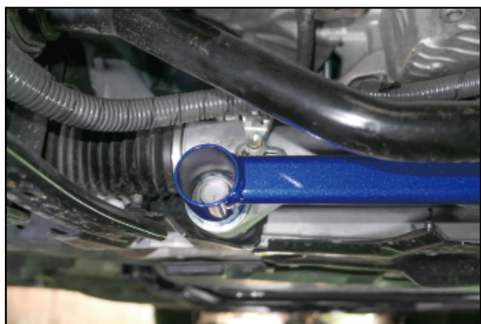
See figure 2 (參考圖表二)