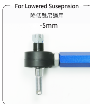
For Lowered Suspension