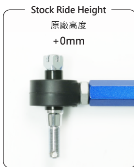
Stock Ride Height