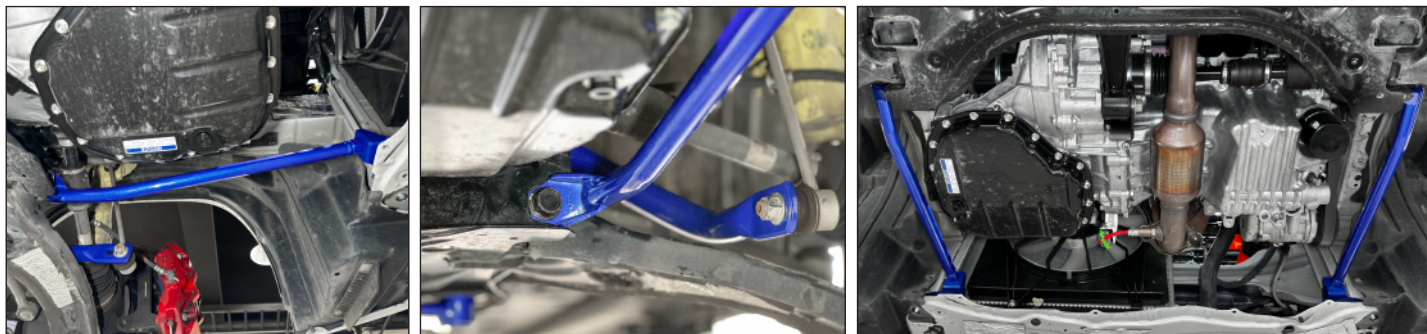
► Illustration of installed state 安裝完成示意圖

拆卸下三角架/控制臂的前端固定螺絲，並使用 ③ 螺絲，將 ② 主桿身安裝至前端支架，另一端使用原廠螺絲鎖至三角架/控制臂鎖點。